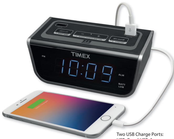
Two USB Charge Ports: USB-C and USB-A